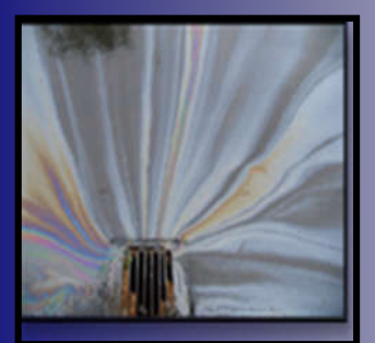
6.) Discharges of runoff from material storage areas, which contain chemicals, fuels, grease, oil, or other hazardous materials from material storage areas.