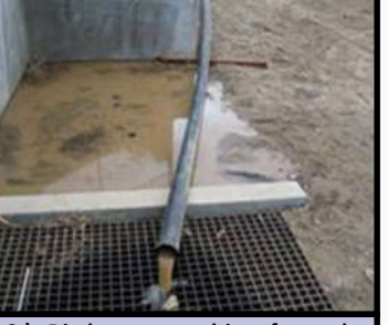
3.) Discharges resulting from the cleaning, repair, or maintenance of any type of equipment, machinery, or facility, including motor vehicles, cement-related equipment, and port-a-potty servicing.