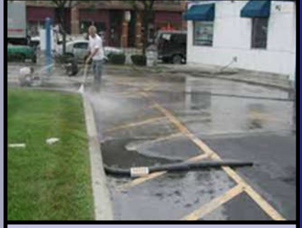
5.) Discharges of wash water from the cleaning or hosing of impervious surfaces in municipal, industrial, commercial, or residential areas (including parking lots, streets, sidewalks, driveways, patios, plazas, work yards and outdoor eating or drinking areas.