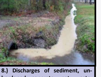
hardened concrete, pet waste, vegetation clippings, or other landscape or construction-related wastes.