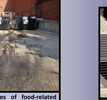
10.) Discharges of food-related wastes (grease, restaurant kitchen mat and trash bin wash water.)