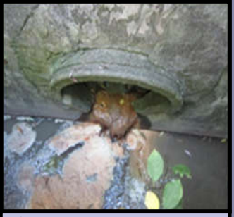
1.) Septic, sewage, and dumping or disposal of liquids or materials other than stormwater.