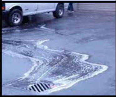
4.) Discharges of wash water from mobile operations, such as mobile automobile or truck washing, steam cleaning, power washing, and carpet cleaning.