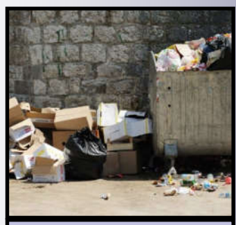
Discharges of food-related wastes (grease, restaurant kitchen mat and trash bin wash water.)