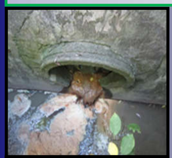
Septic, sewage, and dumping or disposal of liquids or materials other than stormwater.

The prohibited non-stormwater discharges include, but are not limited to, the following: