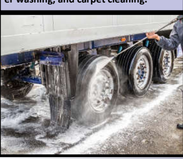
Discharges of wash water from the cleaning or hosing of impervious surfaces in municipal, industrial, commercial, or residential areas (including parking lots, streets, sidewalks, driveways, patios, plazas, work yards and outdoor eating or drinking areas.