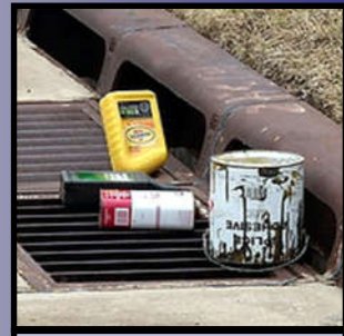
Discharges of trash, paints, stains, resins, or other household hazardous waste.