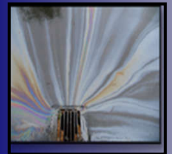
Discharges of runoff from material storage areas, which contain chemicals, fuels, grease, oil, or other hazardous materials from material storage areas.