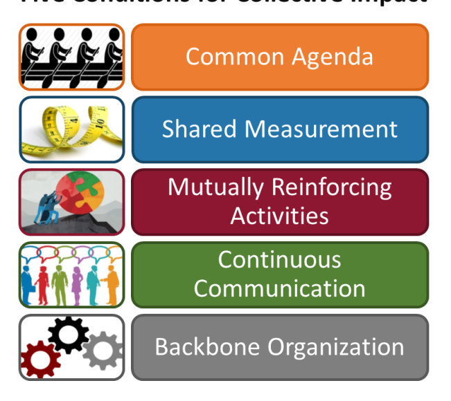
Figure adapted from FSG.org

collective impact approach to effectively create change are: a common agenda, shared measurement, mutually reinforcing activities, continuous communication, and backbone support organizations.