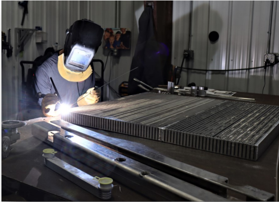
A welder plies his trade at Radiator Supply House in Sweet Home. Linn County is business friendly.

beans, and raise beef cattle and sheep. The number of acres devoted to hazel nut production increases annually, currently topping more than 10,000 acres.