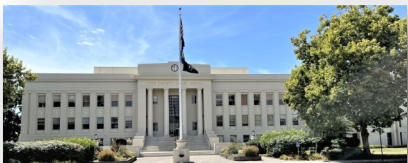
Linn County Courthouse