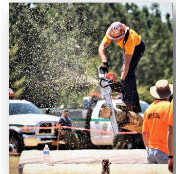
Sportsman's Holiday is held every July in Sweet Home.