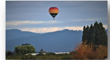
A hot air balloon in flight during the annual Northwest Art & Air Festival held every August in Albany.

The total assessed value of property in Linn County is $11.1 billion with a real property value of more than $21 billion.