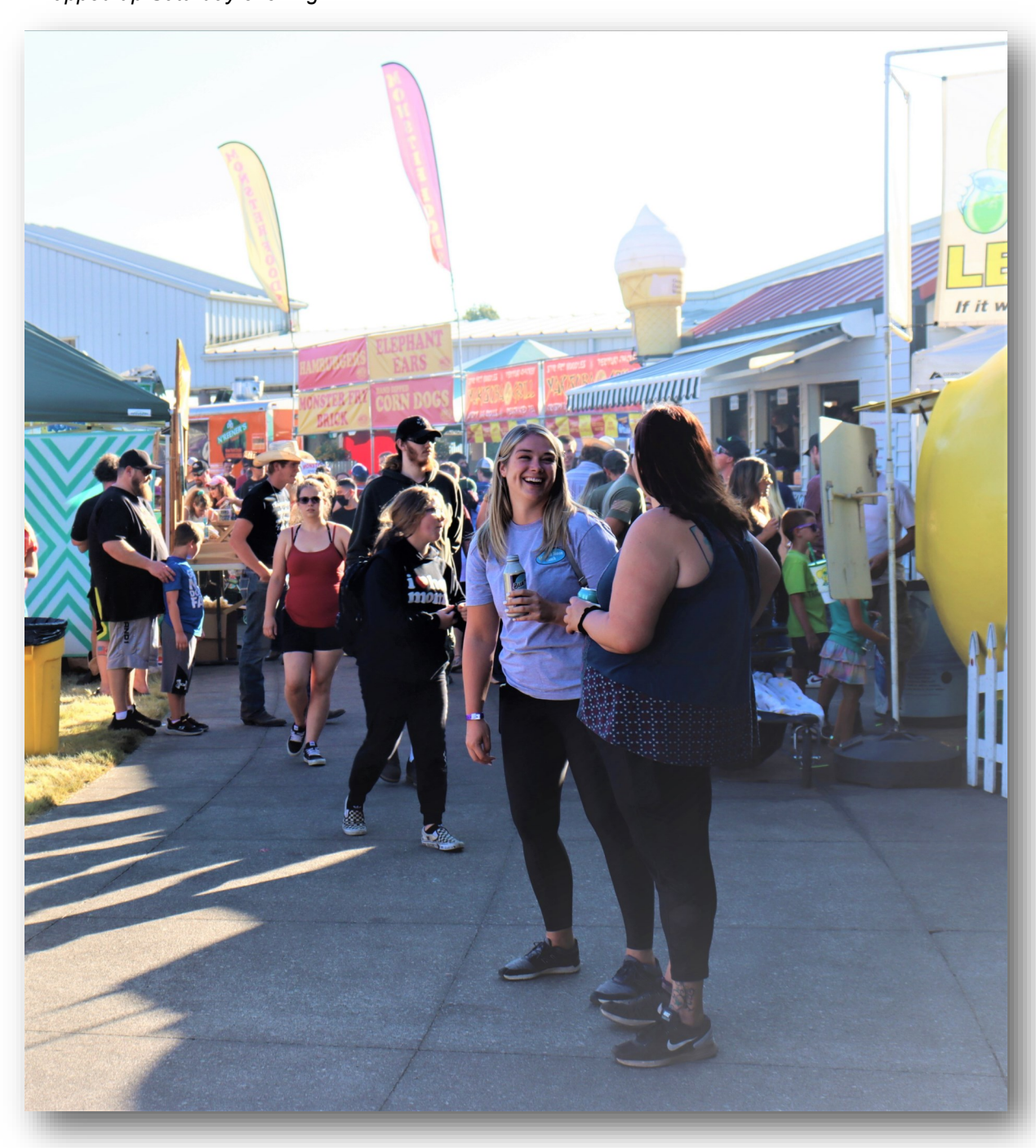
A record 34,330 people attended the Linn County Fair Thursday, Friday and Saturday at the Linn County Fair & Expo Center in Albany.