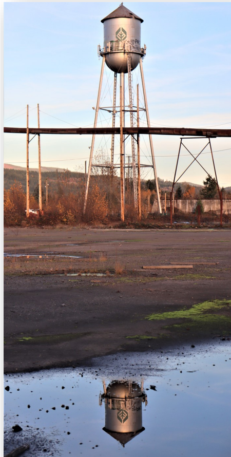
The image of the old Willamette Industries water tower is reflected in a puddle of water.

All of the commissioners are concerned that selling the property as a whole — without DEQ waivers across the board — could someday result in parts of the site coming back into county ownership.