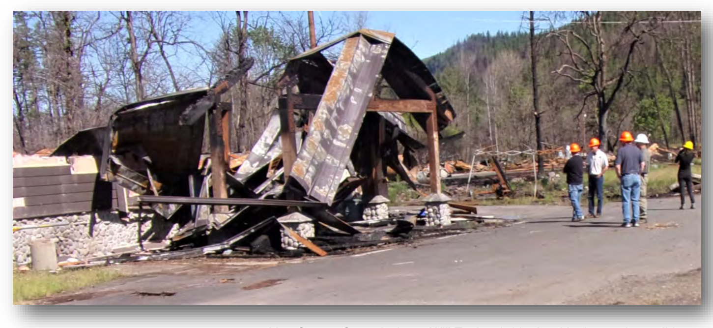
Linn County Commissioner Will Tucker (white hard hat) examines wildfire damage in the Santiam Canyon, including loss of a ranger's station.

Wildfires consume forests, kill wildlife, pollute our air and damage waterways. The very animals the HCP is trying to protect are in greater danger in passively managed forest than a healthy actively managed forest. This HCP will decimate Oregon's ability to make climate-friendly wood products; the only building material that actually stores carbon. The HCP pushes the need for wood products on other countries ignoring available counties timber which creates a much bigger worldwide impact