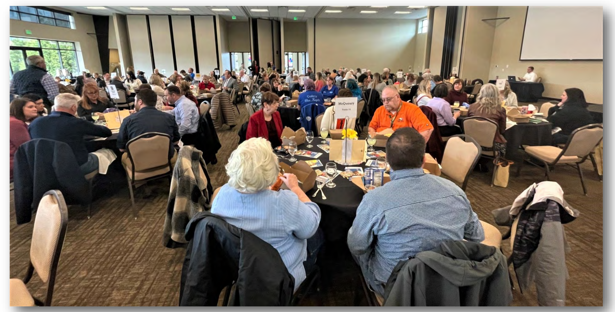
Several hundred people attended the "I Am for the Child" luncheon to support Linn County Court Appointed Special Advocates April 19 at the Boulder Falls Conference Center in Lebanon.