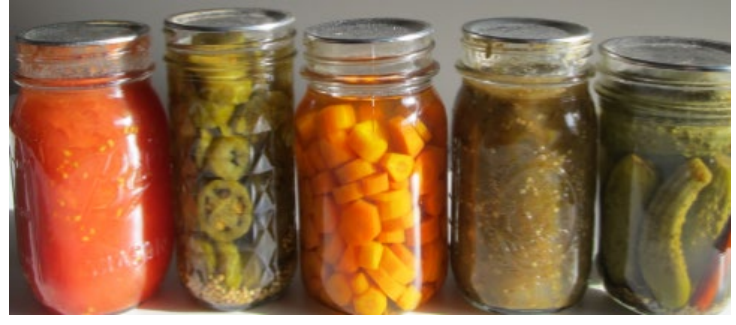
Complete, current food preservation information

Website: beav.es/4eC including a Free Canning Checklist app